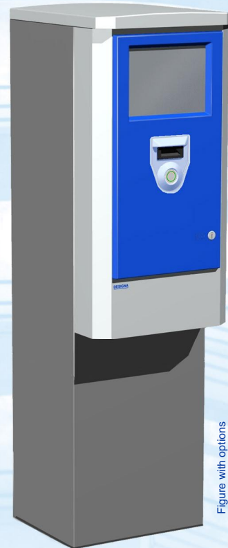
Figure with options